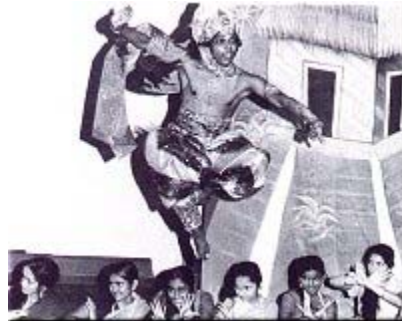
"Dengei" Dance Drama in Fiji islands

Girmit was another landmark production presented as a folk ballet depicting a century’s interchange of culture between Indian identities and the indigenous peoples of the Fiji Islands. Its style was based on the traditional dances of the indigenous and immigrant people of the Islands. Staged in Suva, Fiji in 1979, the ballet had 300 participants and received wide acclaim throughout Fiji, a landmark production by any standard.